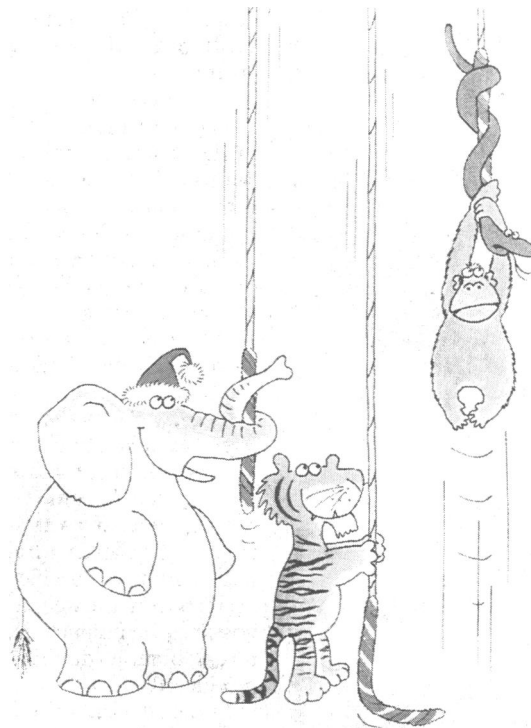
FIG 1—Popular conception of a common hazard of bell ringing—the high speed lift

Four of the eight injuries reported in table II required first aid or medical attention and one was potentially very serious. The figures indicate that although less than 2% of ringers injure themselves each year, this represents about 724 injuries a year throughout the British Isles and roughly half of these require first aid or other medical attention.